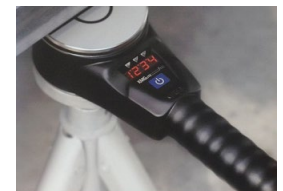
Quick Force Test Official Training Centre